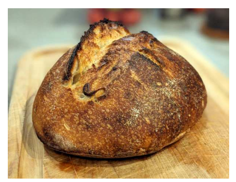
OBLIGATORY QUARANTINE CRAFT.

USA – While we were locked down, quarantined, and sheltered in place, we had time to bake bread, walk in the park, and get a few chores done. For many months we've had three adults in the house, all working or going to college remotely... thanks, Zoom and Teams! A few trips to Minnesota were welcome breaks. And we are all ready to return to a new normal. Merry Christmas, Happy New Year... and WEAR YOUR MASK!