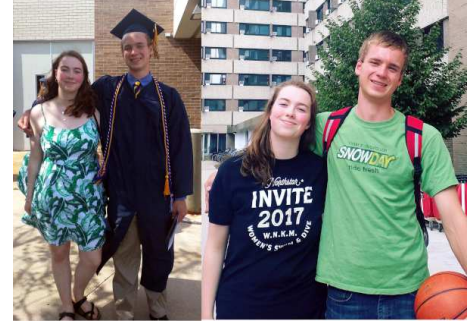
GONE, BUT NOT TOO FAR: GRADUATION (LEFT) TO UW MOVE-IN (RIGHT).