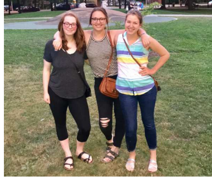
THREE STRONG WOMEN.