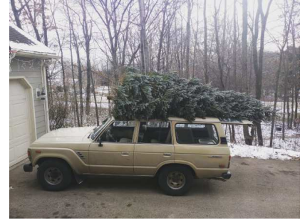
EIN GROßER TANNENBAUM.