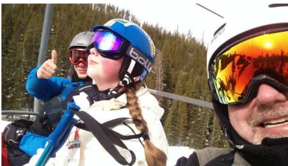
BOARD, SKI, SKI.

WINTER PARK, CO – The fracking snow fracking fell. The fracking people from fracking Wisconsin arrived. Not even a fracking blizzard stopped them. This has happened before, and it will happen again. So say we all. Frack.