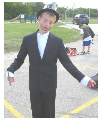
MR. LINCOLN ORATING.