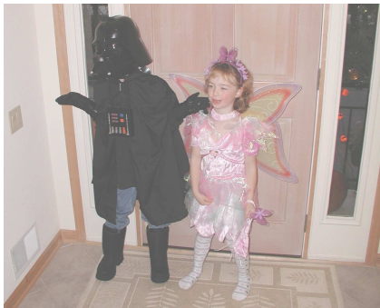
MR. VADER AND HIS NEW APPRENTICE.

DEATH STAR, SOMEWHERE BEYOND THE OUTER RIM – Unsatisfied with his ability to strike fear into the heart of any living creature, restless to move beyond the power of the dark side of the force, Darth Vader announced today that he will be taking on a new apprentice in the form of a small pink fairy. “This alliance will give me additional darkish pink power – with her I will wipe out the rebellion once and for all,” Mr. Vader said. “I like playing barbies. Trick or Treat!” said the fairy apprentice.